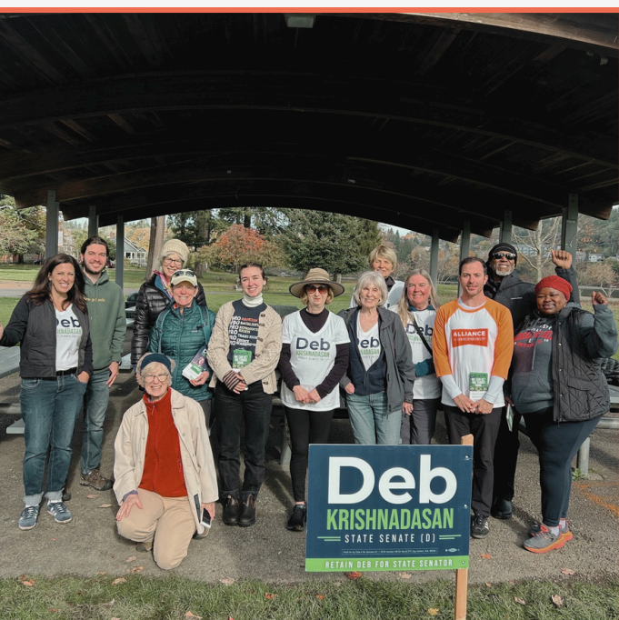
Sofie with Sen. Deb Krishnadasan and fellow canvassers in the critical 26 th LD