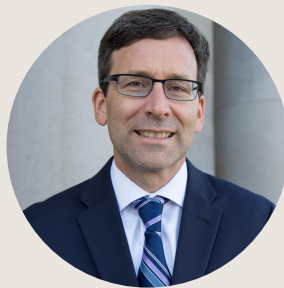
Bob Ferguson (D) Governor, Washington