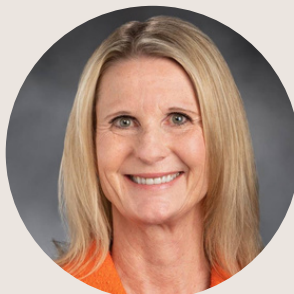
Patti Kuderer Insurance Commissioner