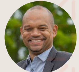
Chipalo Street (D) 37th LD, House