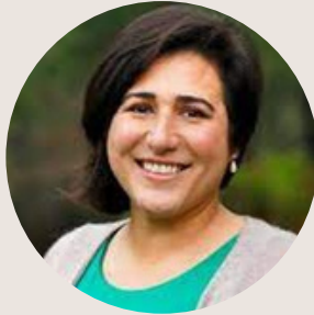
Emily Randall (D) WA 6th Congressional District