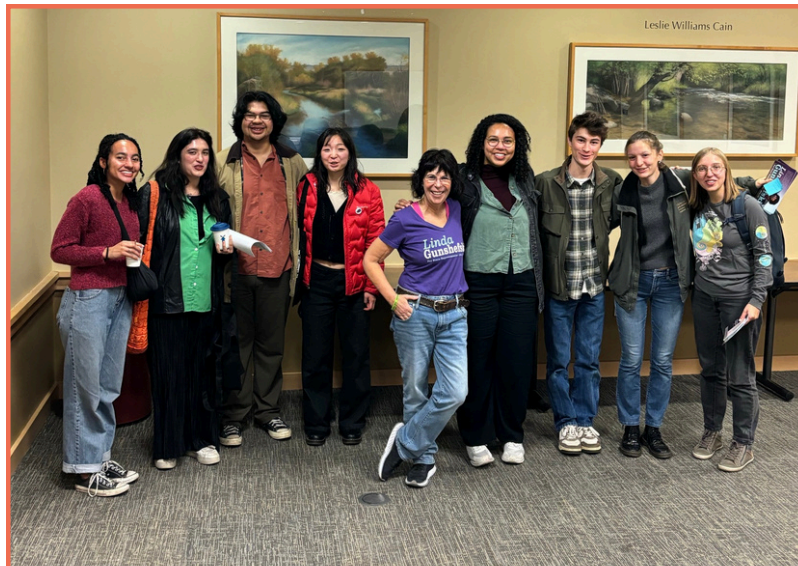
Student canvassers help GOTV In Walla Walla

Pro-Choice Washington also held our first ever canvass in Walla Walla with Whitman College students and canvassed with the Washington Bus to connect with youth voters in Cheney!