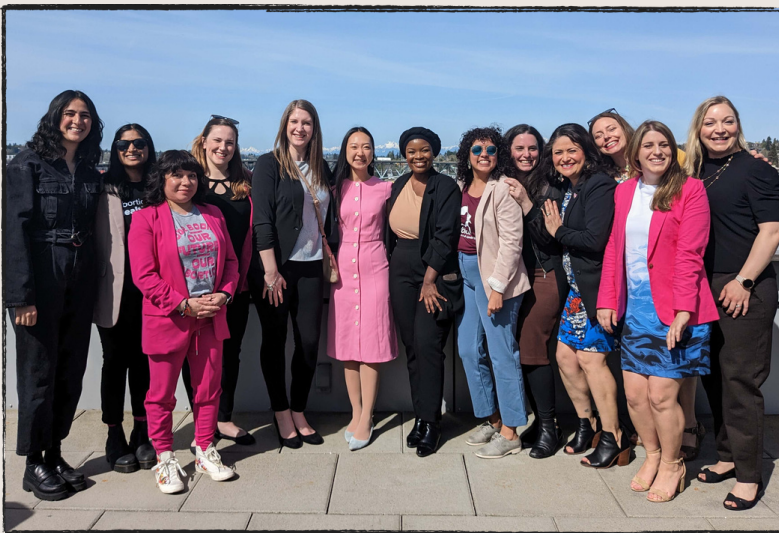
Above: The Reproductive Health, Rights, and Justice Coalition gathers for the Governor's historic bill signing.

READ OUR 2023 LEGISLATIVE SESSION REPORT