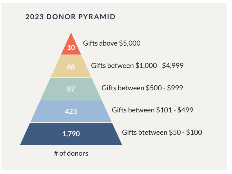
A snapshot of Pro-Choice Washington Donors (large to small) in 2023

2023 has been a time of strategic multichannel engagement of our longtime supporters and those newly energized members and growing our reach in response the majority of Washingtonians (and indeed, Americans) wanting to protect abortion. At the same time, we designed for organizational resiliency given then philanthropic forecast of decreased giving--a trend expected to continue in 2024.