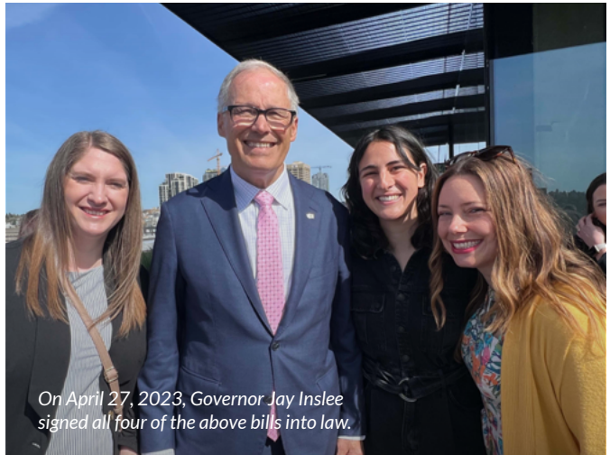
On April 27, 2023, Governor Jay Inslee signed all four of the above bills into law.