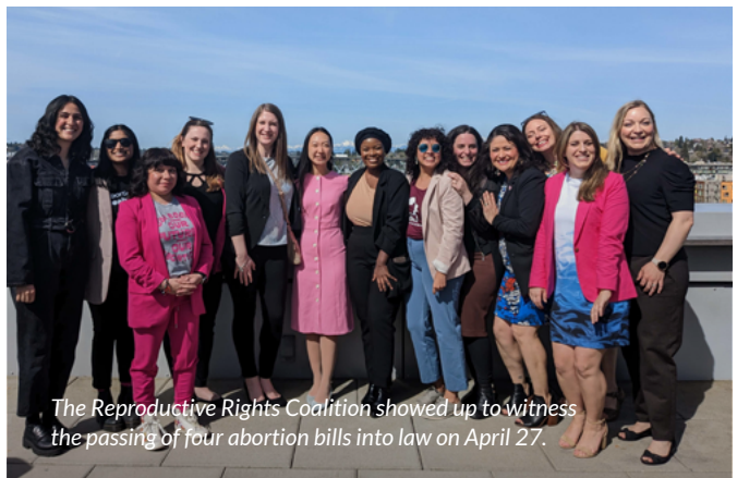
The Reproductive Rights Coalition showed up to witness the passing of four abortion bills into law on April 27.