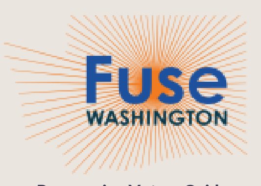
Progressive Voters Guide From Fuse Washington